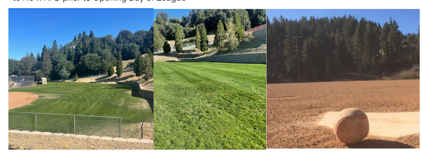
Fees, hours, dates, and facilities are subject to change • Proof of Insurance is Required • Onsite Security Fees may apply • Cleaning Fees may apply • ALL FACILITIES ARE NONSMOKING PER CA GOVERNMENT CODE CHAPTER 32 SECTION 7597